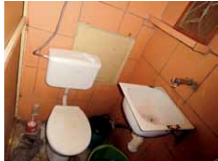
Sanitary facilities in one of the cells (PTDR in Łódź)