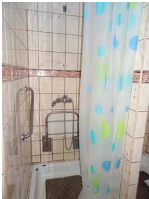
Interior of one of the shower cabins for convicts (Pr in Lubliniec)