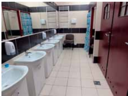
Charges' bathroom (YCC in Węgrzynów)