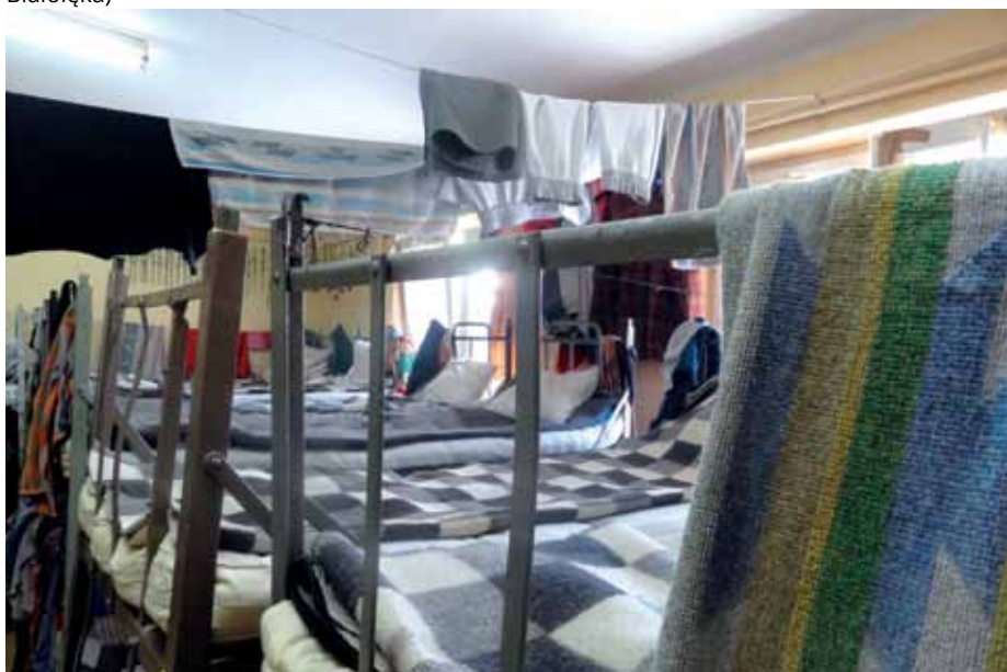
One of the multi-occupational residential cells (Pr in Łowicz)