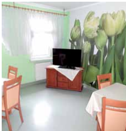
Dining room (SCC in Poznań)