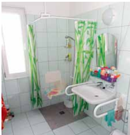
Bathroom (SCC in Poznań)