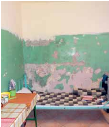
Residential cell (PTDC in Warsaw-Białołęka)