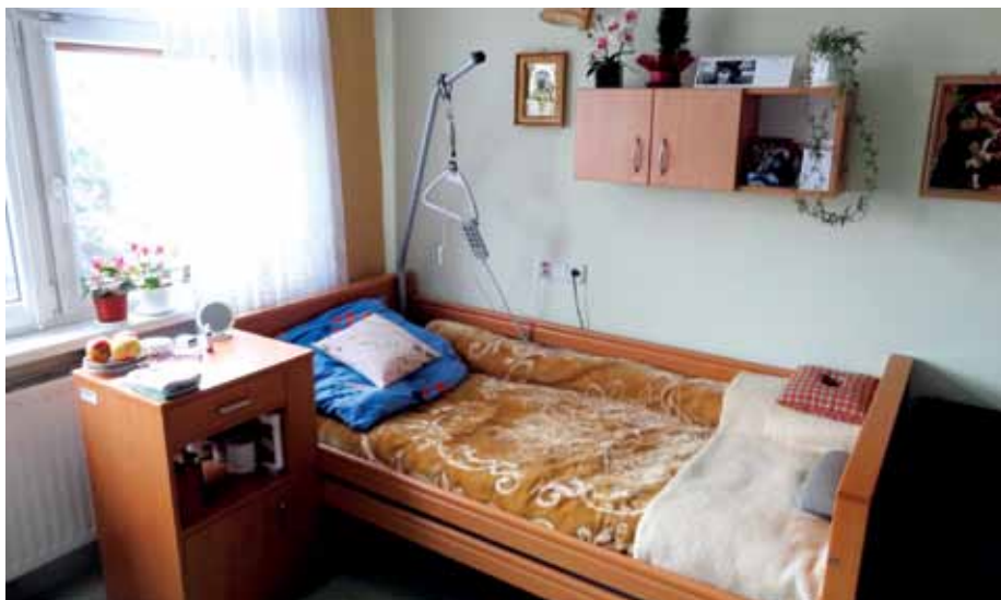
One of the residents' rooms (SCC in Poznań)