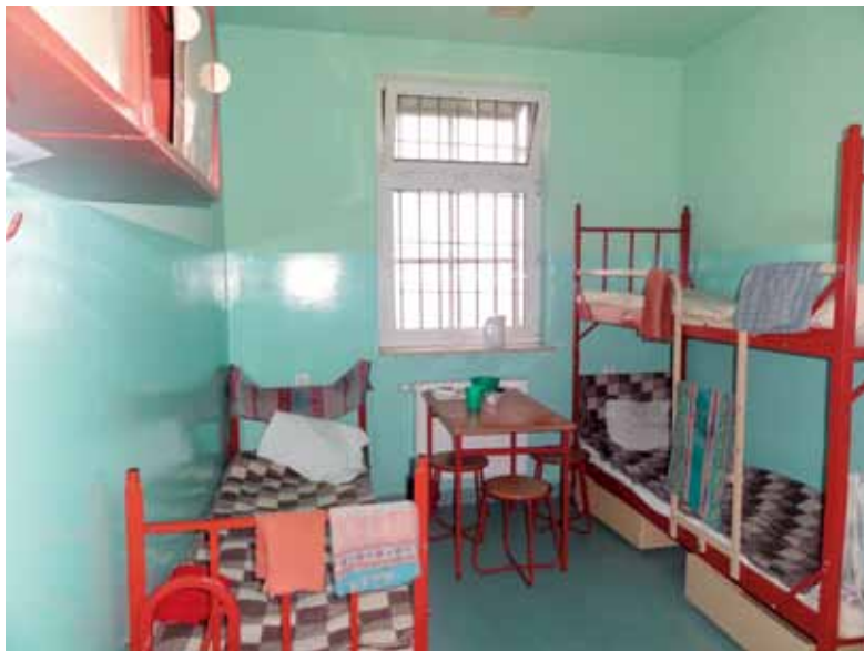
Residential cell (Pr in Opole Lubelskie)